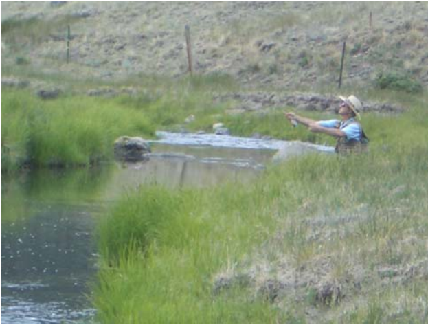
Figure 4 Settling into a selected fishing spot

select your area carefully. It is especially advantageous to work a bow in the river with a deep bank where you can nurse the fly through the turn and into a riffle.