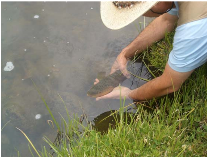
Figure 5 Hold fish in water until it swims away

Another technique is to simply drop the fly onto the water and let out about 20-25 feet of