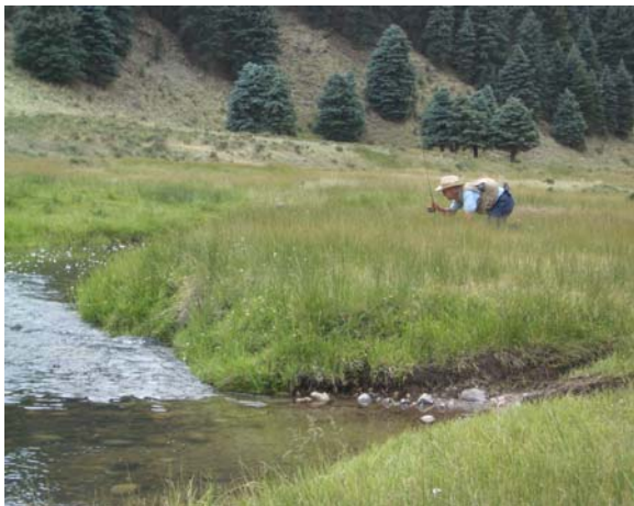
Figure 3 Stealthily approach the river's edge.

At the completion of a rotation, a fisherman or woman has an excellent opportunity to entice a fish to strike. As you approach the stream, keep your head low and out of sight of