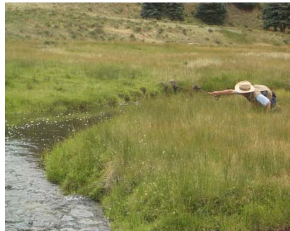
Figure 2 Drop the fly over the river's edge

the fish. Keeping in mind that the top of your hat is higher than your eyes, you should never see the water for if you do, then your hat will be visible to the fish and your presence is announced.